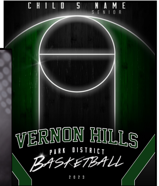
Custom Background Upgrade #2 $10