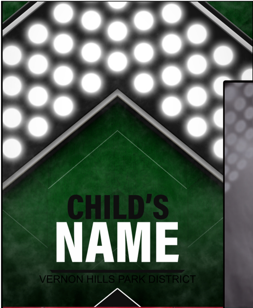
Custom Background Upgrade #1 $10